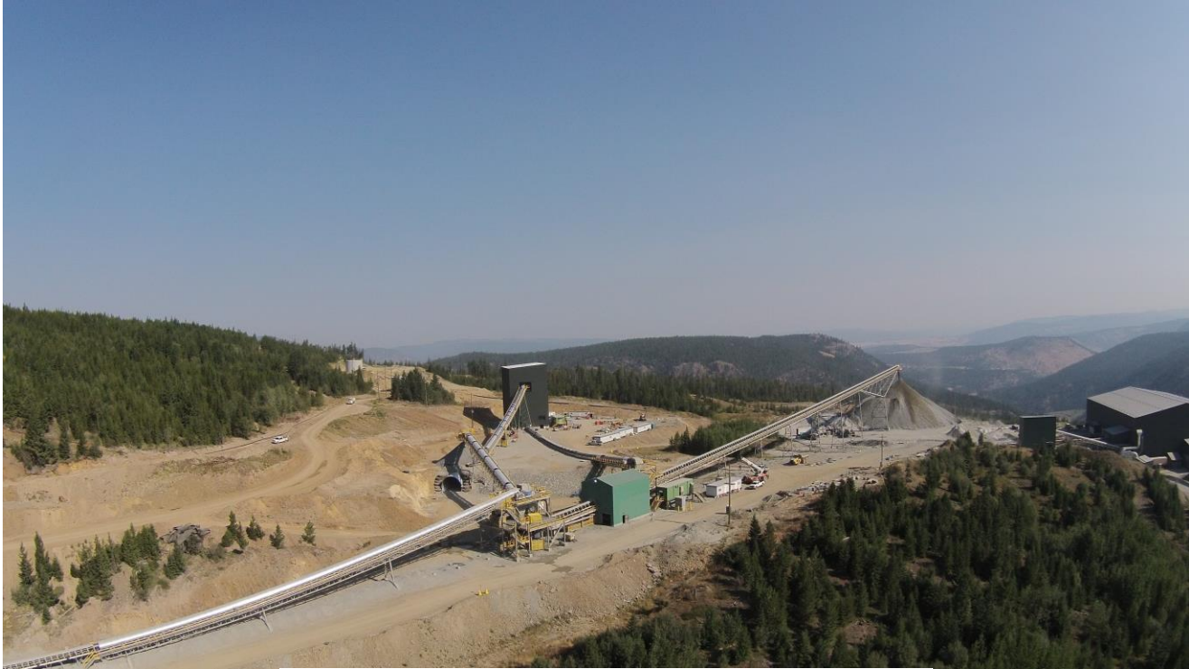
Aerial View of Completed Secondary Crusher Installation