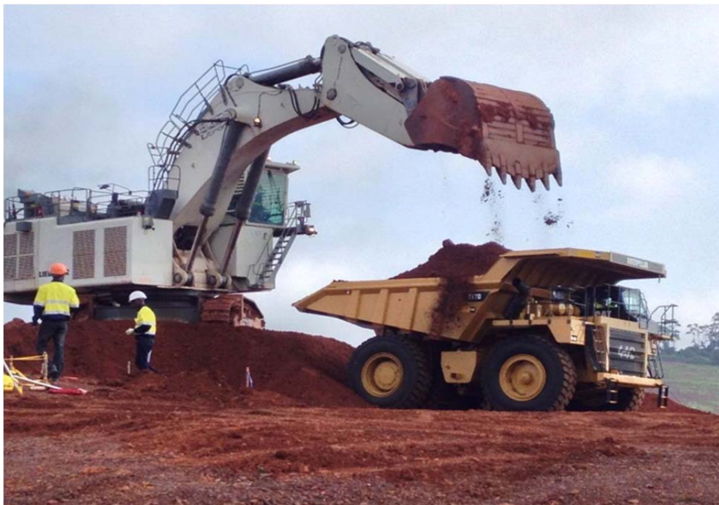
Figure 5: Mining commences on South Pit, October 2013