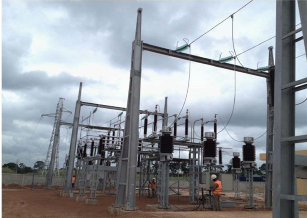
Figure 4: 91kV substation