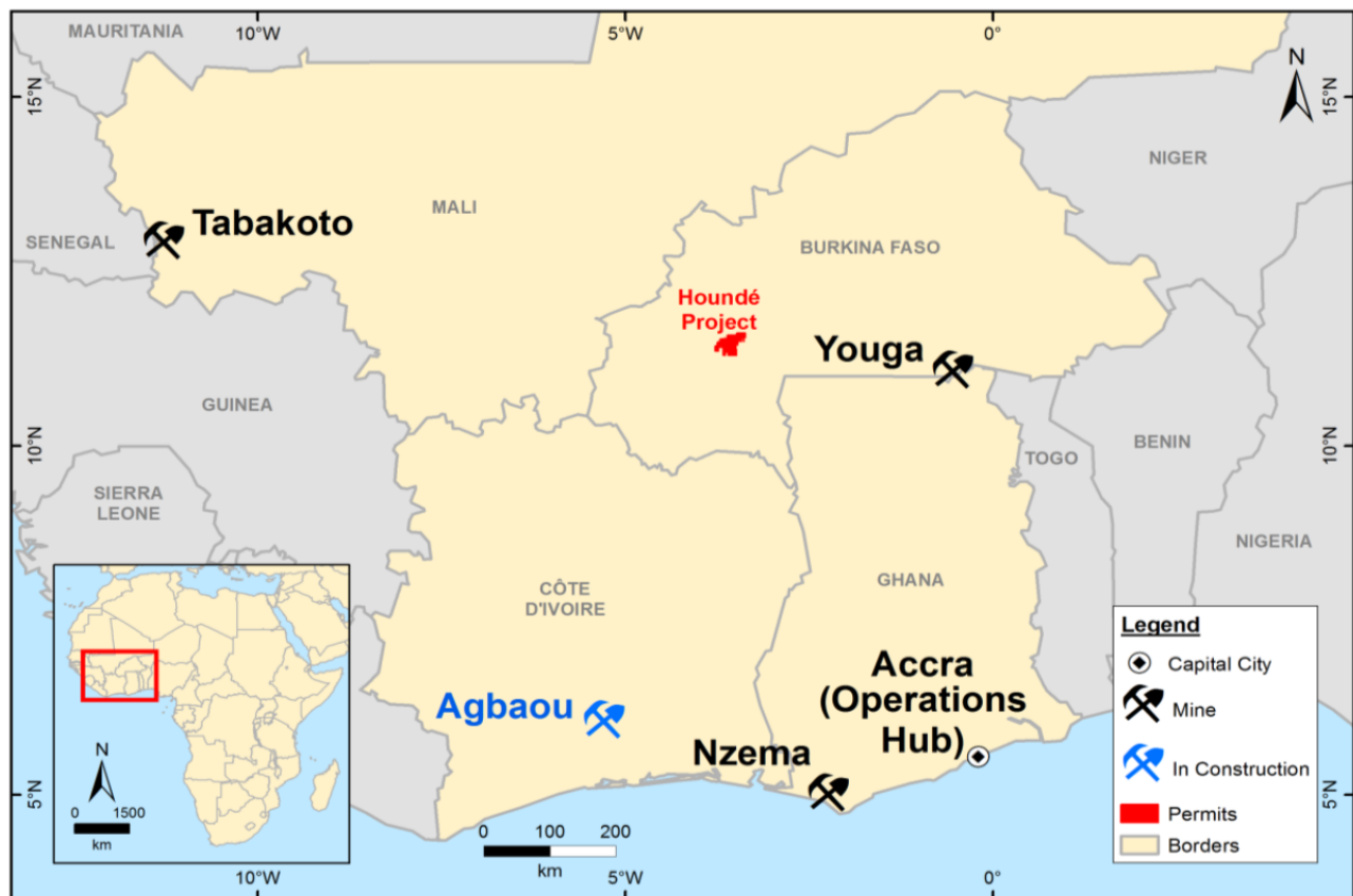
Figure 1: Endeavour's West African mines, Agbaou construction project and Houndé feasibility study project.

On October 18, 2012 Endeavour acquired Avion Gold Corporation ("Avion"), which owned the Tabakoto gold mine in Mali, ("Tabakoto" or the "Tabakoto gold mine"). As a result, Endeavour's comparative operational and financial results for the three and nine months ended September 30, 2012 do not include the operating results from Tabakoto.