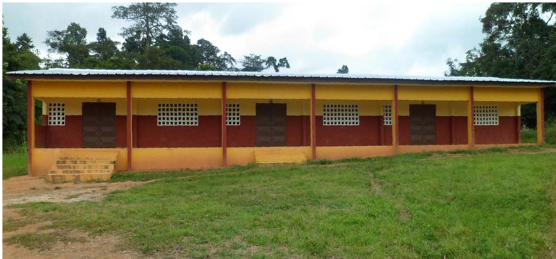
Figure 7: Agbaou Primary School, constructed by Endeavour, handover during the third quarter of 2013