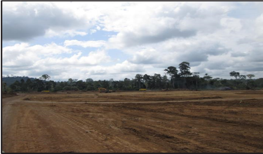
Figure 2: Clearing for Agbaou process plant, September 2012