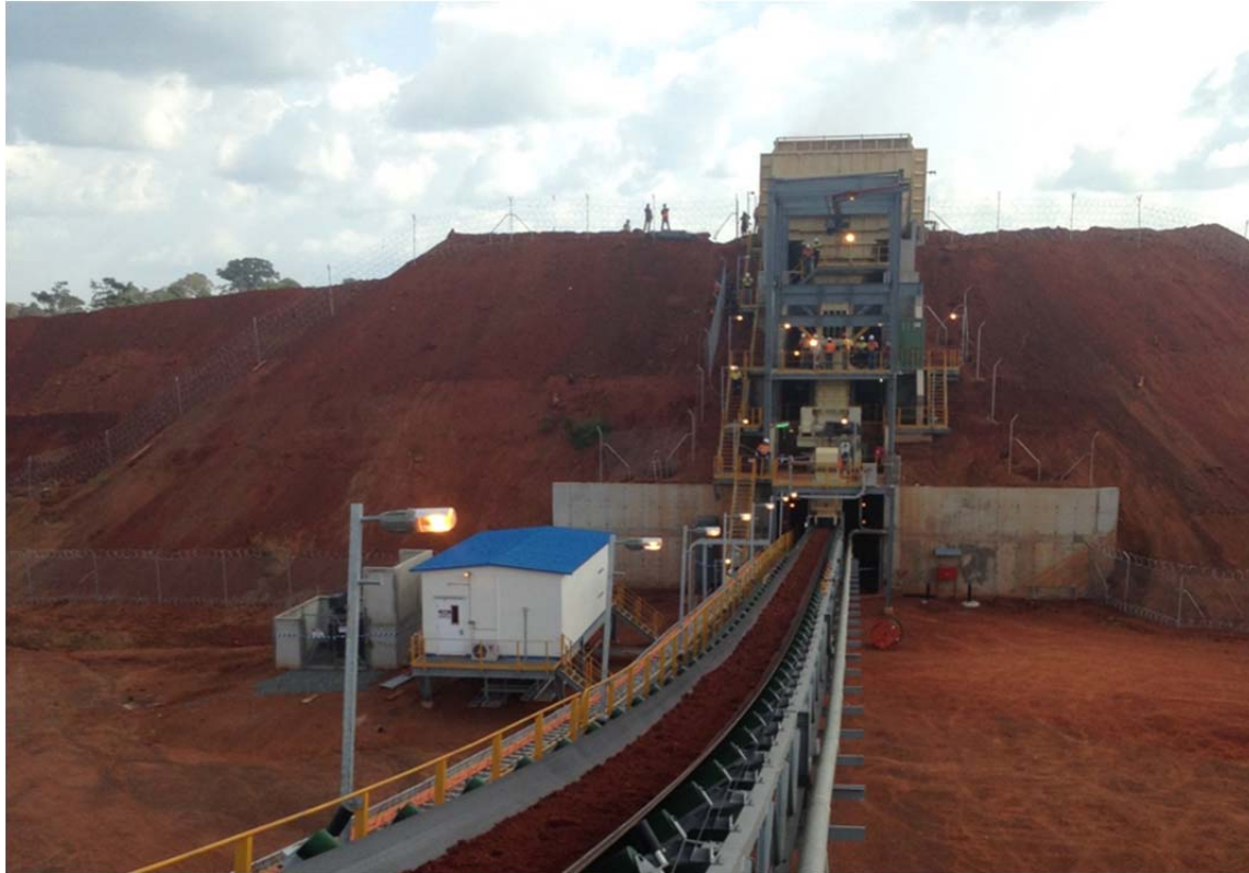
Figure 6: Crushing vault and conveyor with first ore, October 2013