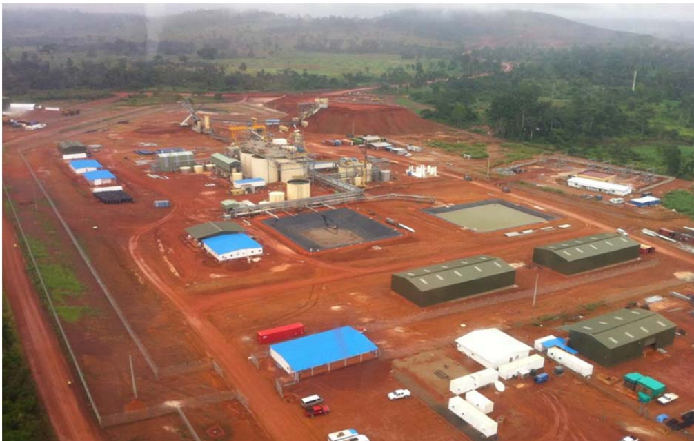
Figure 3: Agbaou Gold Mine process plant aerial, October 2013